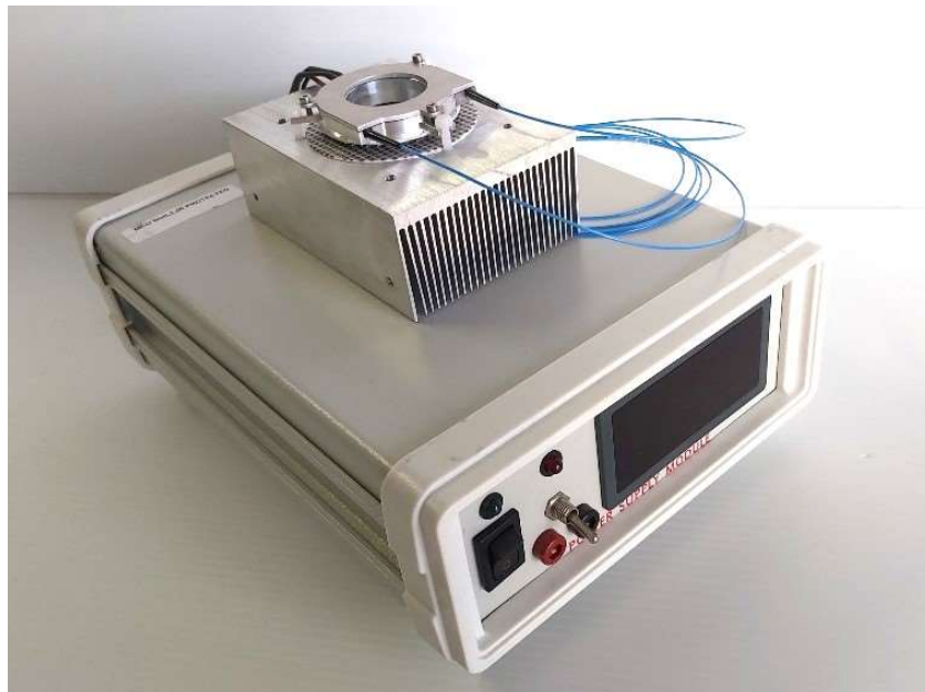
Fig. 3. OETFG-300T Thermo-Tunable FBG Filter (turn-key)